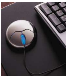
Online: our new web based legal debt recovery service

We are pleased to announce the launch of our new Online facility for our debt recovery clients, which is accessed via our website. Online enables you to instruct us, view case records, reports and to communicate with us online. We have seen a number of similar packages offered by our competitors and in my view, Online is second to none.